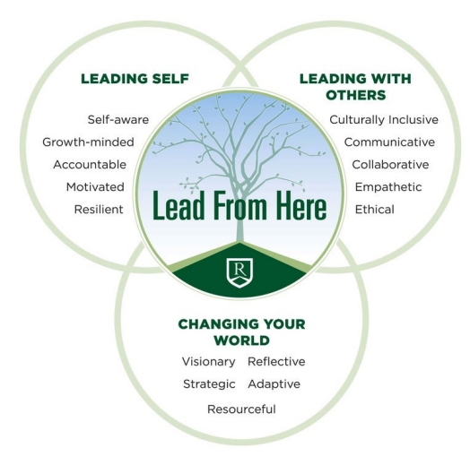
Citizen Leader Framework